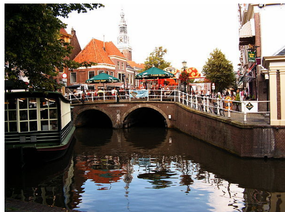
Canal and bridge

The municipality of Alkmaar consists of the following cities, towns, villages and/or districts: Alkmaar, Koedijk (partly), Overdie, Oudorp and Omval.