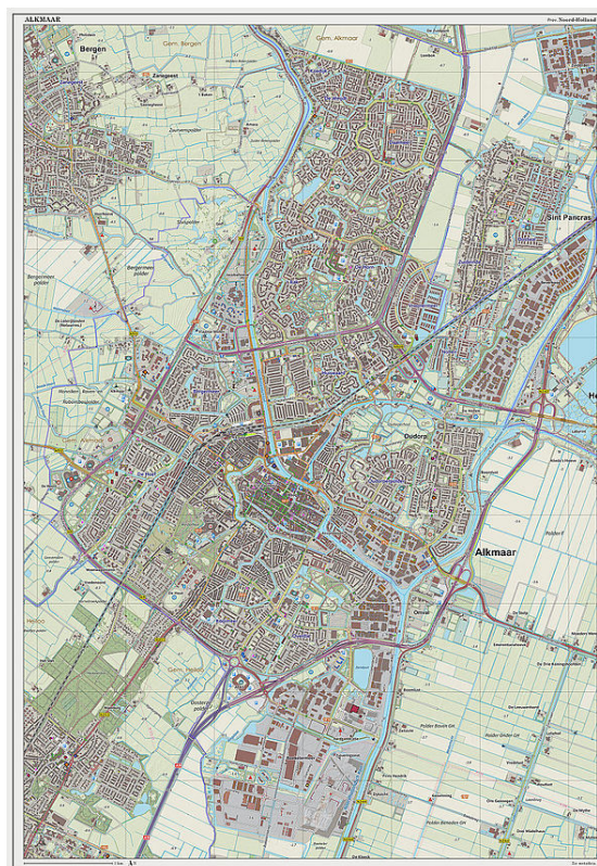
Topographic map of Alkmaar, Sept. 2014