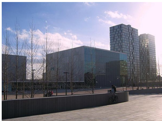
Theatre "Schouwburg Almere"

The traffic infrastructure in Almere is recognisable because of its separate infrastructure for cycles (which have separate cycle paths), cars and buses (In Almere the buses drive on a separate bus lane). Almere is connected to the motorways A6 and A27.