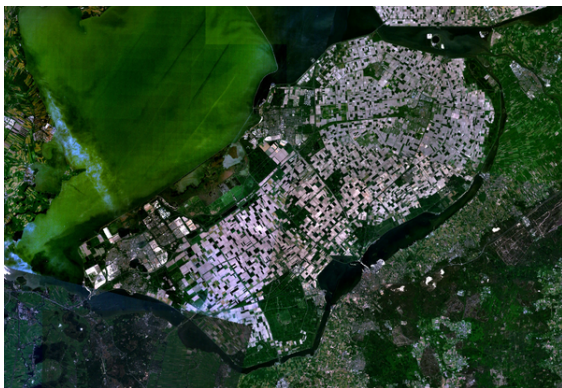
Satellite image of the Flevoland polder island.

Almere is located in the polder of Southern Flevoland (Dutch: Zuidelijk Flevoland ). It is the most western municipality of the province Flevoland. It borders with Lake Marken in the west and north, Lelystad in the northeast, Zeewolde in the east, and Lake Gooi in the south.