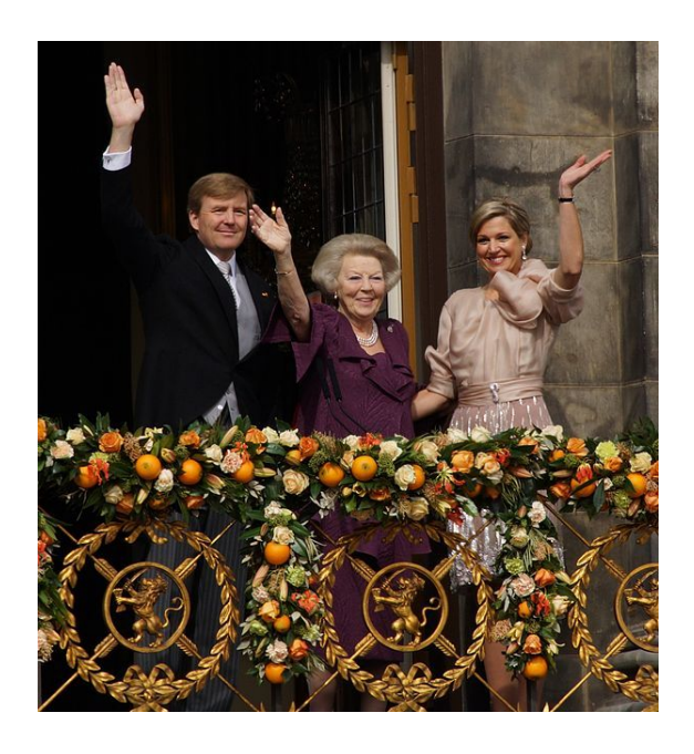
Princess Beatrix following her abdication with her son and successor and his wife

In 2009, Forbes estimated her wealth at US$300 million.<sup>[25]</sup>