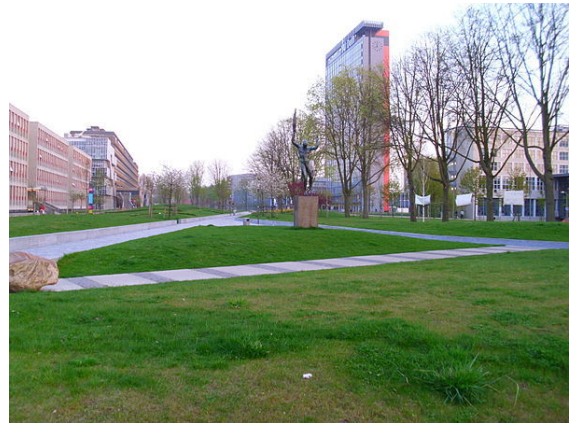
TU Delft buildings