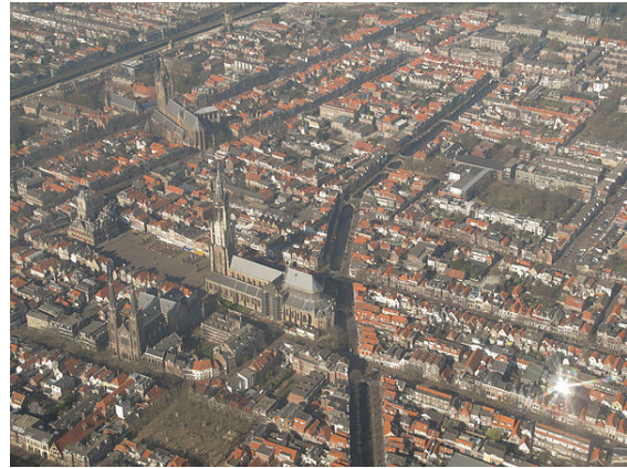
Delft, two churches in town center (de Nieuwe Kerk and de Oude Kerk)