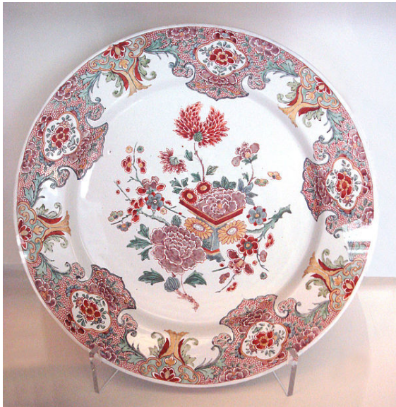
Delft blue is most famous but there are other kinds of Delftware, like this plate faience in rose

Delft is well known for the Delft pottery ceramic products [6] which were styled on the imported Chinese porcelain of the 17th century. The city had an early start in this area since it was a home port of the Dutch East India Company. It can still be seen at the pottery factories De Koninklijke Porceleyn Fles (or Royal Delft) and De Delftse Pauw.