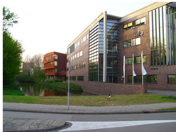
Site at business park “Delftechpark”

Delft University of Technology (TU Delft) is one of three universities of technology in the Netherlands. It was founded as an academy for civil engineering in 1842 by King William II. Today well over 16,000 students are enrolled.