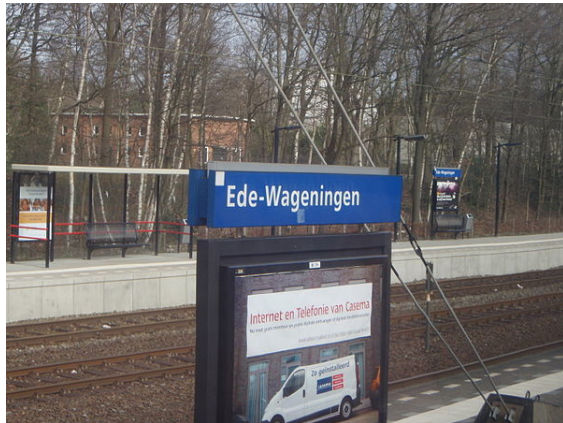
Ede-Wageningen railway station

Ede is situated along the A12 motorway and has a direct link to the A1 via the A30.