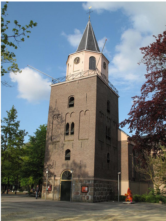
Emmen, church: Grote of Pancratiuskerk

A prime example of a planned city, Emmen arose from several small farming and peat-harvesting communities which have dotted the province of Drenthe since the Middle Ages. Traces of these communities can still be seen in