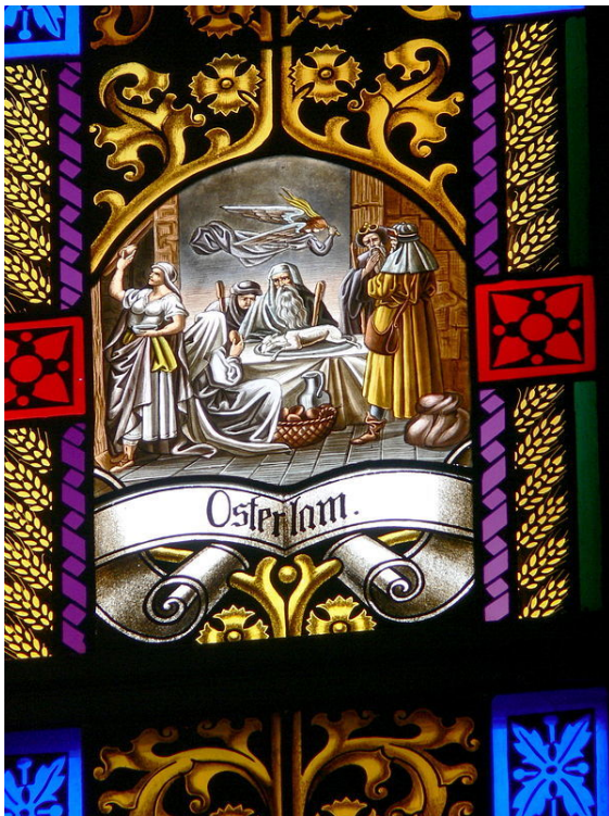
A stained glass window depicting the Passover Lamb , a concept integral to the foundation of Easter. [30][50]

Easter and the holidays that are related to it are moveable feasts , in that they do not fall on a fixed date in the Gregorian or Julian calendars (both of which follow the cycle of the sun and the seasons). Instead, the date for Easter is determined on a lunisolar calendar similar to the Hebrew calendar. The First Council of Nicaea (325) established two rules, independence of the Jewish calendar and worldwide uniformity, which were the only rules for Easter explicitly laid down by the Council. No details for the computation were specified; these were worked out in practice, a process that took centuries and generated a number of controversies. (See also Computus and Reform of the date of Easter .) In particular, the Council did not decree that Easter must fall on Sunday. This was already the practice almost everywhere. [51]