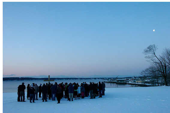
Sunrise service in Rockland, Maine, United States.

The Easter Vigil concludes with the celebration of the Eucharist (known in some traditions as Holy Communion). Certain variations in the Easter Vigil exist: Some churches read the Old Testament lessons before the procession of the Paschal candle, and then read the gospel immediately after the Exsultet.