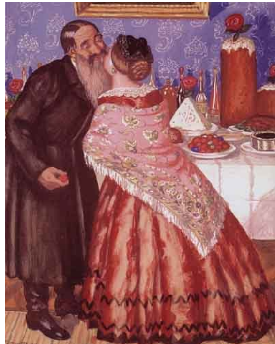
Boris Kustodiev's Pascha Greetings (1912) shows traditional Russian khristosovanie (exchanging a triple kiss), with such foods as red eggs, kulich and paskha in the background.

events are all seen as necessary but preliminary to, and illuminated by, the full climax of the Resurrection, in which all that has come before reaches fulfillment and fruition. They shine only in the light of the Resurrection. Easter is the primary act that fulfills the purpose of