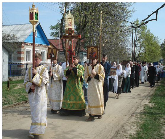
Traditional Paschal Outdoor Procession during Bright Week by Russian Orthodox Old-Rite Church.

This procession reenacts the journey of the Myrrhbearers to the Tomb of Jesus “very early in the morning”. [84] After circling around the temple once or three times, the procession halts in front of the closed doors. In the Greek practice the priest reads a selection from the Gospel Book . [85] Then, in all traditions, the priest makes the sign of the cross with the censer in front of the closed doors (which represent the sealed tomb).