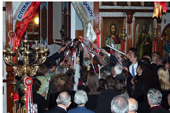
The congregation lighting their candles from the new flame, just as the priest has retrieved it from the altar—note that the picture is flash-illuminated; all electric lighting is off, and only the oil lamps in front of the Iconostasis remain lit. (St. George Greek Orthodox Church, Adelaide).

In the 20th century, some individuals and institutions