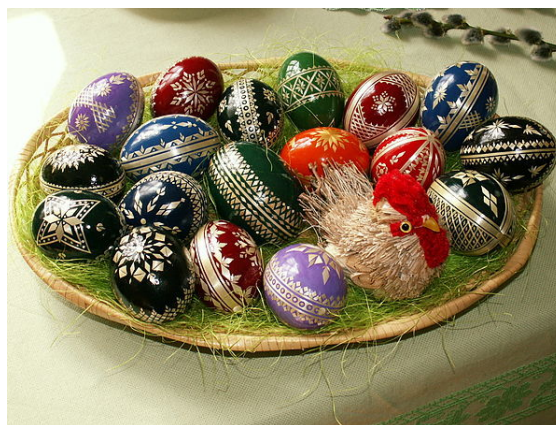
Easter eggs are a popular cultural symbol of Easter.

and Easter Monday are public holidays across all states and territories. “Easter Saturday” (the Saturday before Easter Sunday) is a public holiday in every state except Tasmania and Western Australia, while Easter Sunday itself is a public holiday only in New South Wales. Easter Tuesday is additionally a conditional public holiday in Tasmania, varying between award, and was also a public holiday in Victoria until 1994. [100]