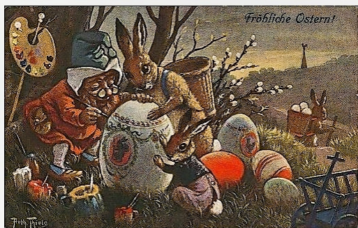
An Easter postcard depicting the Easter Bunny.

many countries in the world also have Easter Monday as a public holiday. Some retail stores, shopping malls, and restaurants are closed on Easter Sunday. Good Friday, which occurs two days before Easter Sunday, is also a public holiday in many countries, as well as in 12 U.S. states. Even in states where Good Friday is not a holiday, many financial institutions, stock markets, and public schools are closed. Few banks that are normally open on regular Sundays are closed on Easter.