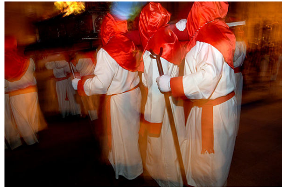
Holy Week procession in Santiago de Compostela, Spain.

The Easter Vigil concludes with the celebration of the Eucharist (known in some traditions as Holy Communion). Certain variations in the Easter Vigil exist: Some churches read the Old Testament lessons before the procession of the Paschal candle, and then read the gospel immediately after the Exsultet.