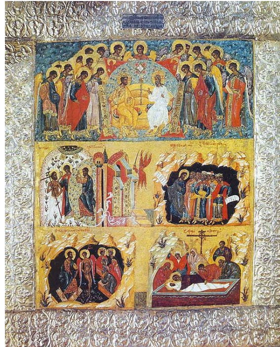
A five-part Russian Orthodox icon depicting the Easter story. Eastern Orthodox Christians use a different computation for the date of Easter than the Western churches.

Controversy arose when Victor , bishop of Rome a generation after Anicetus , attempted to excommunicate Polycrates of Ephesus and all other bishops of Asia for their Quartodecimanism . According to Eusebius , a number of synods were convened to deal with the controversy,