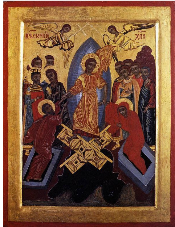
17th century Russian icon of the Resurrection

This is not to say that Christmas and other elements of the Christian liturgical calendar are ignored. Instead, these