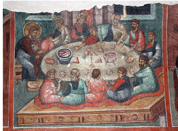
The Last Supper celebrated by Jesus and his disciples. The early Christians too would have celebrated this meal to commemorate Jesus' death and subsequent resurrection.

The first Christians, Jewish and Gentile, were certainly aware of the Hebrew calendar. [nb 4] Jewish Christians, the first to celebrate the resurrection of Jesus, timed the observance in relation to Passover.