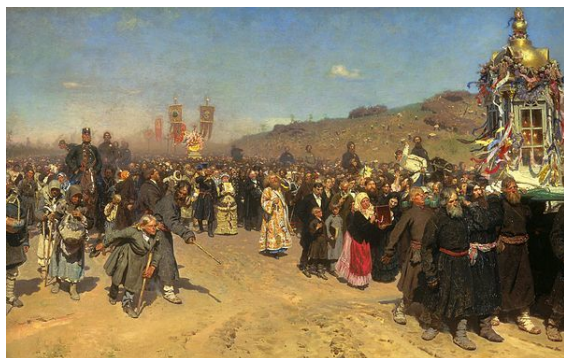
Religious Procession in Kursk Province, a controversial painting by Ilya Repin (1880–83), cynically depicting a Bright Week outdoor procession.

Preparation for Easter begins with the season of Great Lent . In addition to fasting, almsgiving, and prayer, Orthodox Christians cut down on all entertainment and non-essential worldly activities, gradually eliminating them until Great and Holy Friday , the most austere day of the year. On the evening of Great and Holy Saturday , the Midnight Office commences an hour or two before midnight (see paschal vigil ).