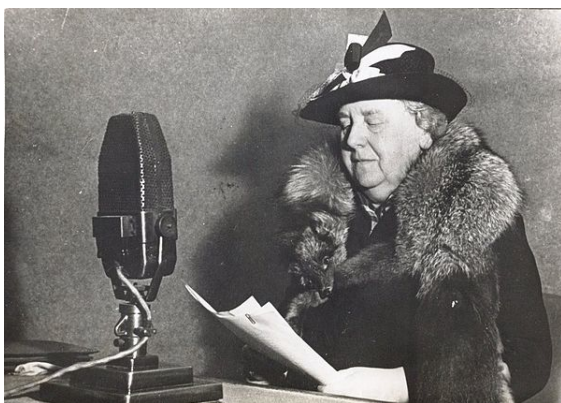
Queen Wilhelmina reading a speech for Radio Oranje in 1940

On 10 May 1940, Germany invaded the Netherlands. There is an ongoing debate about the departure of the Queen and the royal family. Some say that an evacuation to the United Kingdom of the royal family had been planned some time in advance, since at least the end of 1939. [9] Wilhelmina and her family fled The Hague, and