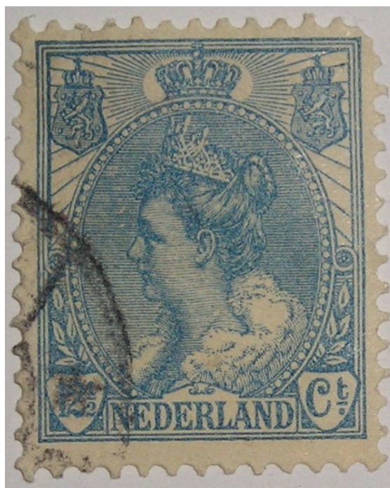
Queen Wilhelmina’s image on a stamp which was used between 1899 and 1926

During the 1920s and 1930s, the Netherlands began to emerge as an industrial power. Engineers reclaimed vast amounts of land that had been under water by building the Zuiderzee Works . In 1934, both Wilhelmina’s mother Queen Emma and her husband, Prince Hendrik, died.