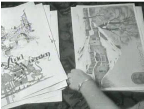
Collecting signatures for the queen, 1948