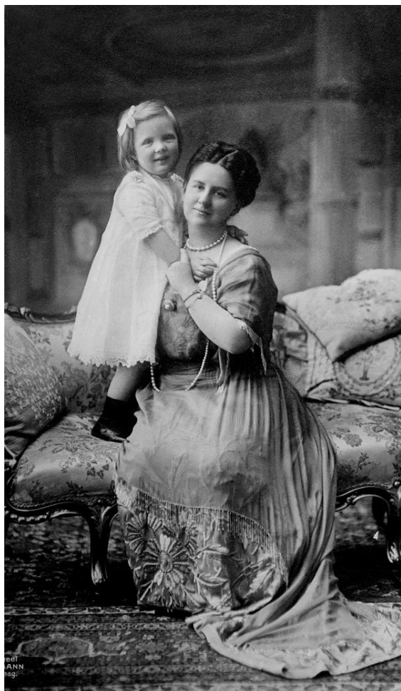
Queen Wilhelmina and her daughter Juliana, circa 1914