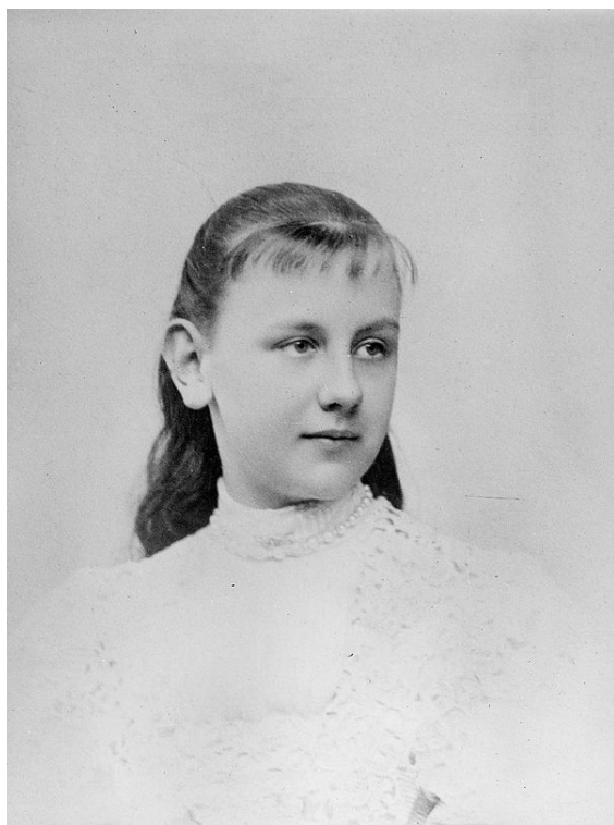
Queen Wilhelmina in the 1890s

Princess Wilhelmina Helena Pauline Maria of the Netherlands, Princess of Orange-Nassau, was born on 31 August 1880 in The Hague, Netherlands. She was the only child of King William III and his second wife, Emma of Waldeck and Pyrmont. Her childhood was characterised by a close relationship with her parents, especially with her father, who was 63 years of age when she was born.