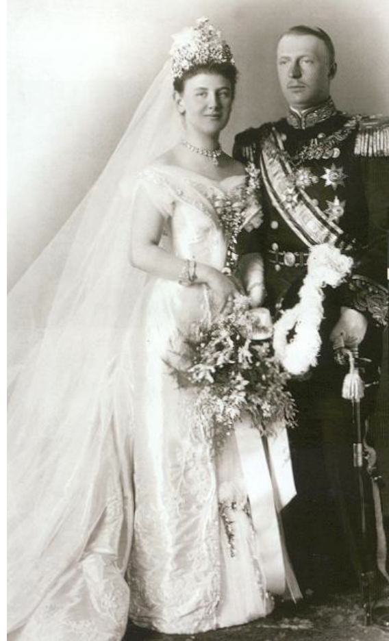
Queen Wilhelmina and Prince Henry at their wedding