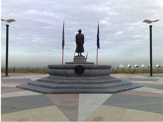
Statue of Queen Wilhelmina in Noordwijk