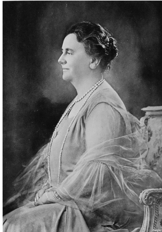
Queen Wilhelmina in 1942

On 10 May 1940, Germany invaded the Netherlands. There is an ongoing debate about the departure of the Queen and the royal family. Some say that an evacuation to the United Kingdom of the royal family had been planned some time in advance, since at least the end of 1939. [9] Wilhelmina and her family fled The Hague, and