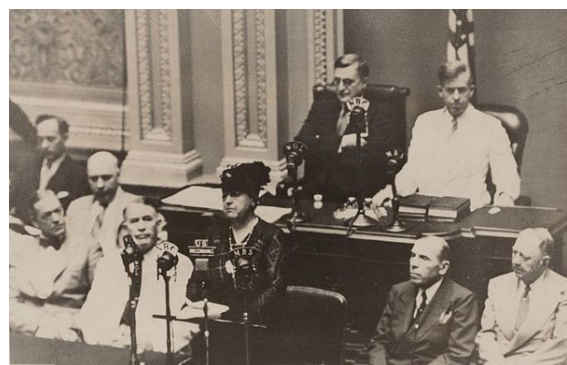
The Queen speaking to the US Congress, 1942.

she boarded HMS Hereward , a British destroyer which was to take her across the North Sea. Others say she boarded the destroyer with the intent of going to the Dutch province of Zeeland, which had not yet been conquered at the time. However, along the journey, it became clear that due to advancing German forces, Zeeland was not safe either, forcing the destroyer to sail for the United Kingdom. In any case, she arrived in the United Kingdom on May 13, planning to return to the Netherlands as soon as possible. [10]