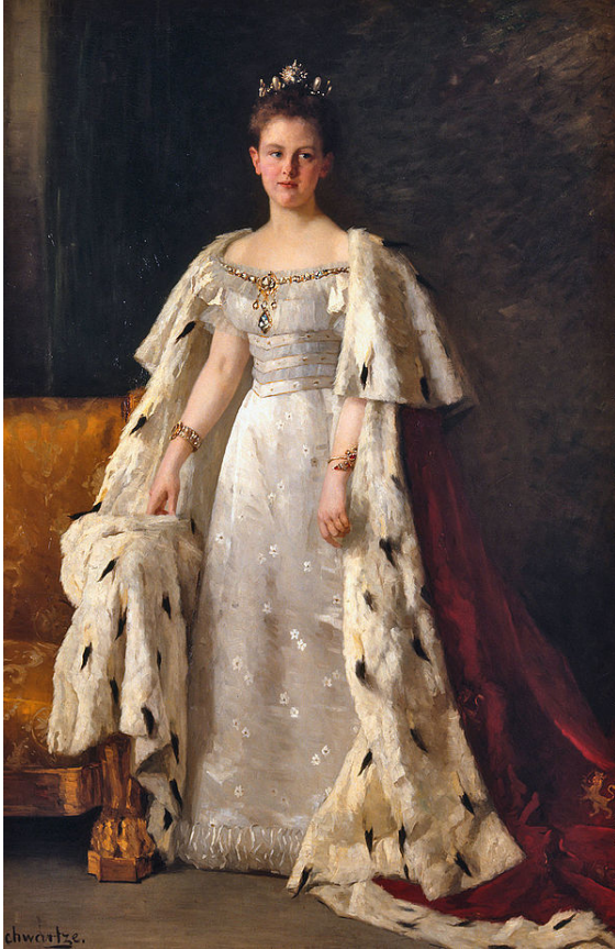
Wilhelmina of the Netherlands wearing her coronation robe in 1898; painting by Thérèse Schwartz

independence, both national and economic”, according to one contemporary publication. [4] The birth of Juliana, on 30 April 1909, was met with great relief after eight years of childless marriage. [5] Wilhelmina suffered two further miscarriages on 23 January and 20 October 1912. [3]