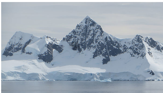
Wilhelmina Bay, Antarctica, is named for Queen Wilhelmina