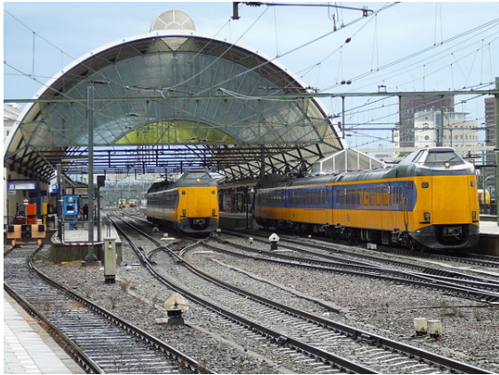
Zwolle railway station with ICMm train