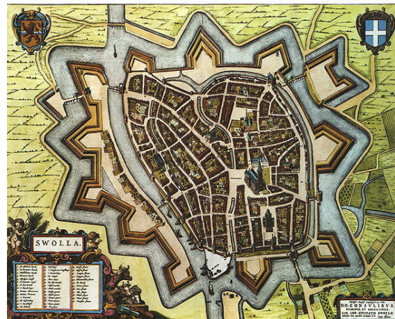
Map of Zwolle by Joan Blaeu in Blaeu’s “Toonneel der Steden”, 1652

In July 1324 and October 1361, regional noblemen set fire to Zwolle. In the 1324 fire, only nine buildings escaped the flames. [10]