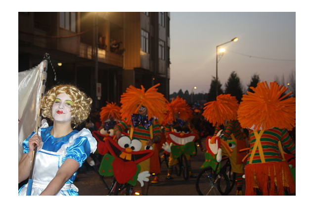
Ovar Carnival, Portugal

In Lisbon, Carnival offers parades, dances and festivities featuring stars from Portugal and Brazil. The Loures Carnival celebrates the country's folk traditions, including the "enterro do bacalhau" or burial of the cod, which marks the end of Carnival and the festivities.