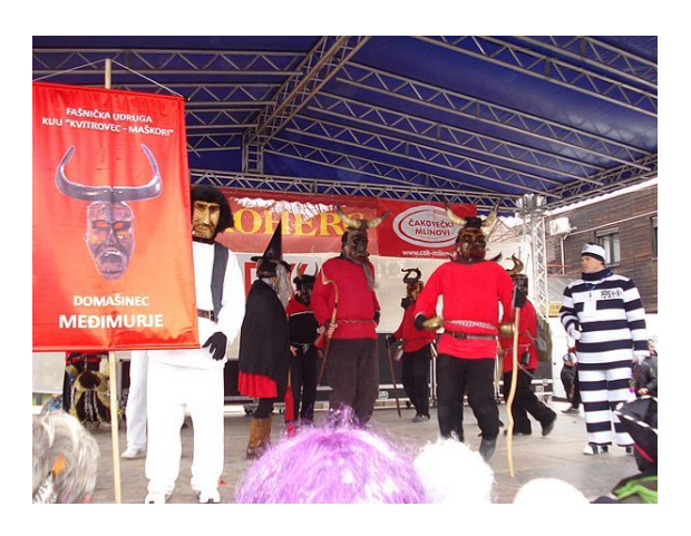
"Carnival of Međimurje", northern Croatia (2011)

The most famous Croatian Carnival (Croatian: "karneval", also called "maškare") is the Rijeka Carnival, during which the mayor of Rijeka hands over the keys to the city to the Carnival master ("meštar od karnevala"). The festival includes several events, culminating on the final Sunday in a masked procession. (A similar procession for children takes place on the previous day.)