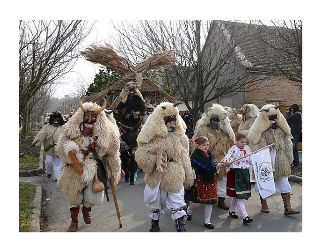
The Busójárás in Hungary

In Mohács, Hungary, the Busójárás is a celebration held at the end of the Carnival season. It involves locals dressing in woolly costumes, with scary masks and noise-makers. They perform a burial ritual to symbolise the end of winter and spike doughnuts on weapons to symbolise the defeat of Ottomans.