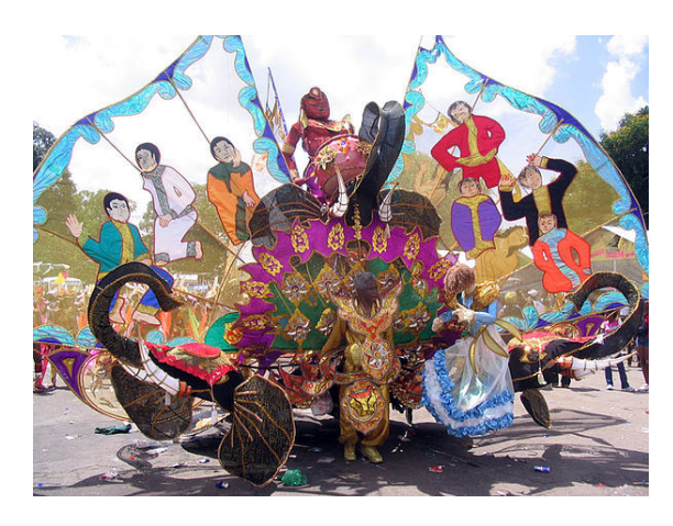
The Carnival King costume for a particular band

Carnival Tuesday hosts the main events. Full costume is worn, complete with make-up and body paint/adornment. Usually "Mas Boots" that complement the costumes are worn. Each band has their costume presentation based on a particular theme, and contains various sections (some consisting of thousands of revelers) that reflect these themes. The street parade and band costume competition take place. The mas bands eventually converge on the Queen's Park Savannah to pass on "The Stage" for