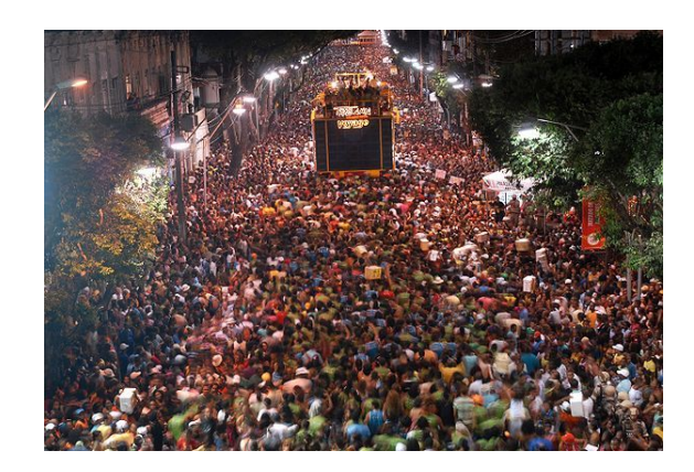
Carnival circuit of the city of Salvador.

Guinness World Records as the largest carnival in the world with approximately two million people each day. [6]