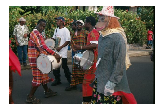
A Dominican Carnival costume band

Guadeloupe, as well as Trinidad. Notable events leading up to Carnival include the Opening of Carnival celebrations, the Calypso Monarch music competition, the Queen of Carnival Beauty Pageant and bouyon music bands. Celebrations last for the Monday and Tuesday before Ash Wednesday.