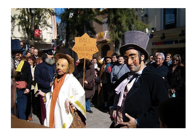
The Ball de Malcasats (Dance of the Mismatched Couples) is a satiric talking-dance traditional to Carnaval in Vilanova.

Plaça de les Cols. In the mysterious sortida del Moixo Foguer (the outing of Little-Bird-Bonfire) accompanied by the Xerraire (jabberer) who insults the crowd. [68] In the King's precession he and his concubines scandalize the town with their sexual behavior. A correfoc (fire run) or Devil's dance (Ball de diables, features dancing youth amid the sparks and explosions of the ritual crew of devils. Other items includes bed races in the streets, the debauched Nit dels Mascarots, Karaoke sausage roasts, xatonades, the children's party, Vidalet, the last night of revelry, Vidalot, the talking-dance of the Mismatched Couples (Ball de Malcasats) and the children's King Caramel whose massive belly, long nose and sausage-like hair hint at his insatiable appetites.