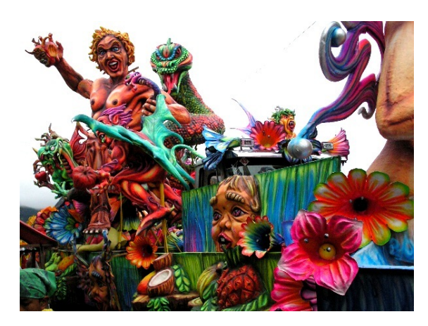
Carnival float in the Blacks and Whites' Carnival in Pasto, Colombia