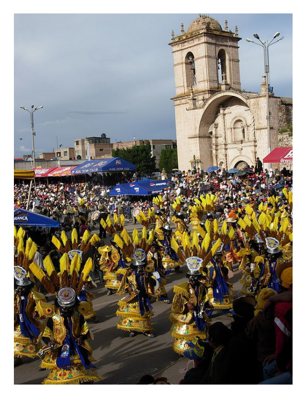
Morenada dance, in the Carnival of the Juliaca city – Perú.

Cajamarca The town of Cajamarca is considered the capital of Carnival in Peru. Local residents of all ages dance around the unhsa , or yunsa , a tree adorned with ribbons, balloons, toys, fruits, bottles of liquor and other prizes.