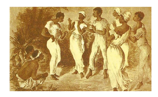
Afro-Uruguayans gathering for a Candombe celebration, ca. 1870

During the celebration, theaters called tablados are built in many places throughout the cities, especially in Montevideo. Traditionally formed by men and now starting to be open to women, the different Carnival groups (Murgas, Lubolos or Parodistas) perform a kind of popular opera at the tablados , singing and dancing songs that generally relate to the social and political situation. The 'Calls' groups, basically formed by drummers playing the tamboril, perform candombe rhythmic figures. Revelers wear their festival clothing. Each group has its own theme. Women wearing elegant, bright dresses are called vedettes and provide a sensual touch to parades.