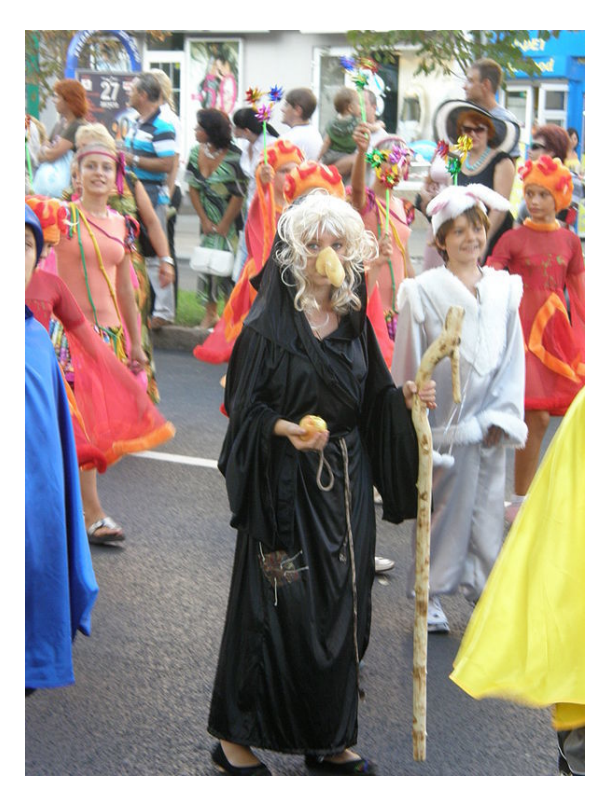
Carnival on the day of Donetsk city in Ukraine, 2010

Carnival was introduced by Portuguese settlers. The celebration is celebrated on each of the archipelago's nine inhabited islands. In Mindelo, São Vicente groups challenge each other for a yearly prize. It has imported various Brazilian carnival traditions. The celebration in SãoNicolau is more traditional, where established groups parade through the Ribeira Brava, gathering in the town square, although it has adopted drums, floats and costumes from Brazil. In São Nicolau three groups, Copa