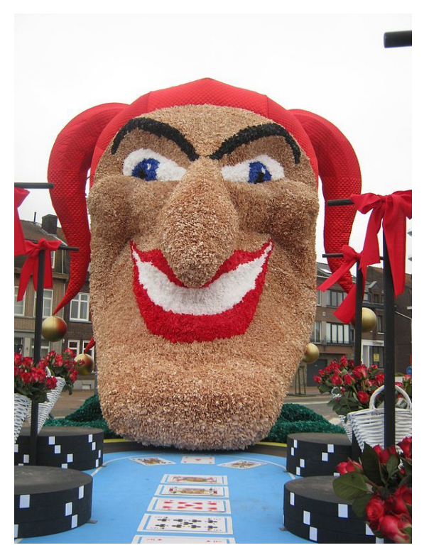
Giant Joker of Maaseik in 2013

Many parts of Belgium celebrate Carnival, typically with costume parades, partying and fireworks. These areas include Heist, Binche, Aalst, Eupen, Malmedy and Kelmis.