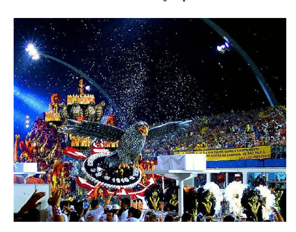
Carnival parade in São Paulo, Gaviões da Fiel Torcida Samba School.

The Carnival in Brazil is a major part of Brazilian Cul-