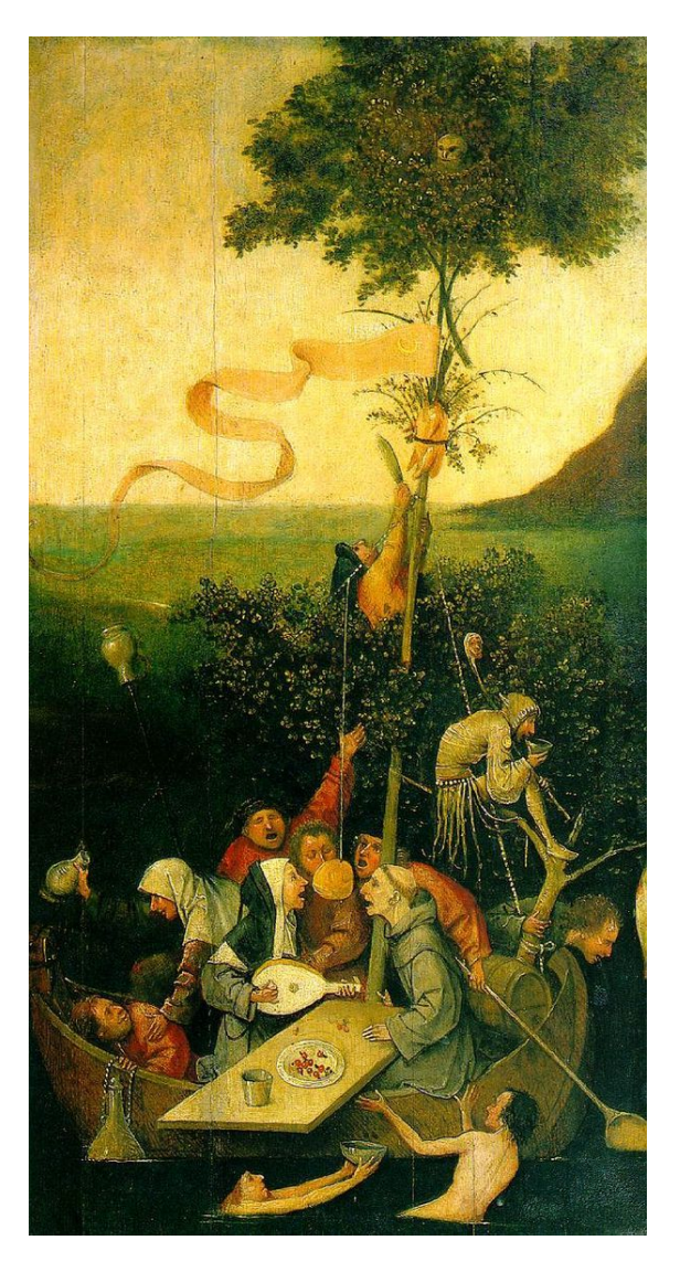
Carnival celebrations in the Southern Netherlands, 1490

Rio de Janeiro's carnival is considered the world's largest, hosting approximately two million participants per day. In 2004, Rio's carnival attracted a record 400,000 foreign visitors. [6]