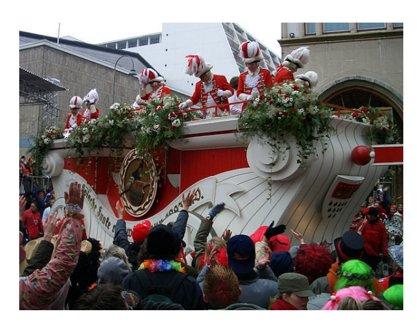
Carnival float in the Rosenmontag parade of the Cologne Carnival, Germany.

Germany The Karneval, Fasching, or Fastnacht season in the German-speaking world officially begins on 11/11 of any given year at 11:11 AM and ends just before midnight on Ash Wednesday the following year after the Monday's Rosenmontag Parade .