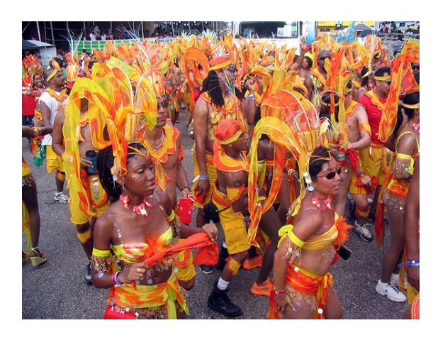
Masqueraders chipping on Carnival Tuesday in Port of Spain during Trinidad and Tobago Carnival

The annual Carnival steel pan competition known as the National Panorama competition holds the finals on the Saturday before the main event. Pan players compete in categories such as "Conventional Steel Band" or "Single Pan Band" by performing renditions of the year's calypsos.