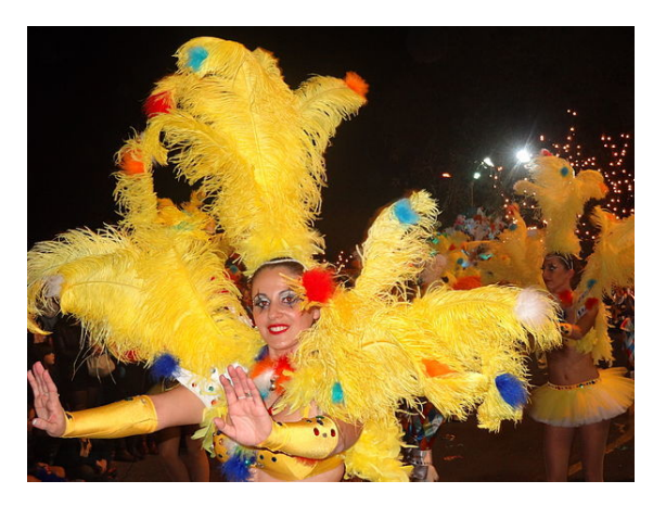
A dancer in the Carnival of Madeira, on the island's capital Funchal