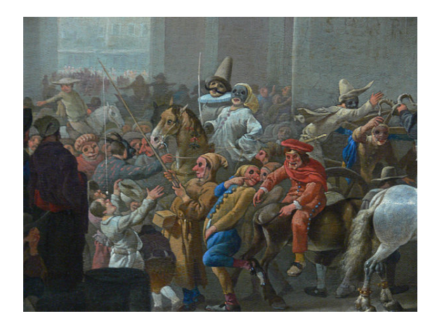
Carnival in Rome circa 1650