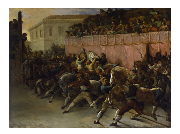
Riderless Racers at Rome by Théodore Géricault. From the mid-15th century until 1882, spring carnival in Rome closed with a horse race. Fifteen to 20 riderless horses, originally imported from the Barbary Coast of North Africa, ran the length of the Via del Corso, a long, straight city street, in about 2½ minutes.

parades, costumes and masks to endure Lent's withdrawal from worldly pleasures.