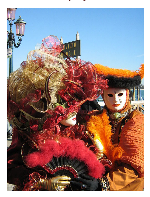
Masquerade at the Carnival of Venice.

Carnival (see other spellings and names) is a fes-