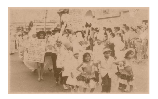
Goan Christians participating at the Goan Carnival, late 20th century