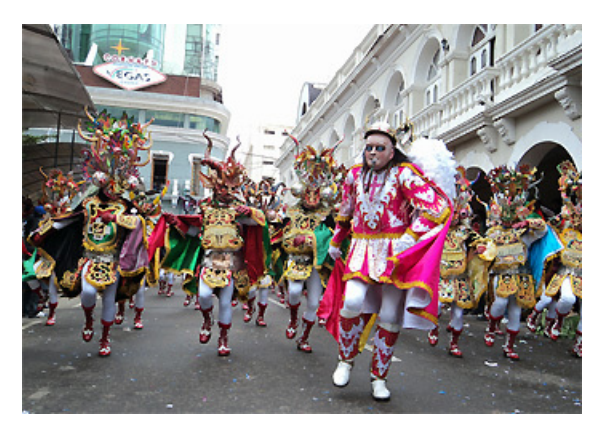
The Diablada, dance primeval, typical and main of Carnival of Oruro a Masterpiece of the Oral and Intangible Heritage of Humanity since 2001 in Bolivia (Image: Fraternidad Artística y Cultural "La Diablada")

La Diablada Carnival takes place in Oruro in central Bolivia. It is celebrated in honor of the miners' patron saint, Virgen de Socavon (the Virgin of the Tunnels). Over 50 parade groups dance, sing and play music over a five kilometre-long course. Participants dress up as demons, devils, angels, Incas and Spanish conquistadors. Dances include caporales and tinkus. The parade runs from morning until late at night, 18 hours a day, 3 days before Ash Wednesday. It was declared the 2001 "Masterpieces of Oral Heritage and Intangible Heritage of Humanity" for UNESCO. [86] Throughout the country celebrations are held involving traditional rhythms and water