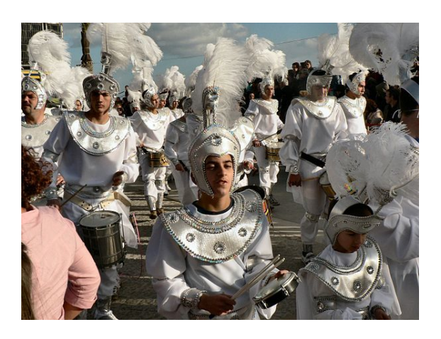
Sesimbra Carnival, Portugal

Carnival in Portugal is celebrated throughout the country, most famously in Ovar, Sesimbra, Madeira, Loulé, Nazaré, and Torres Vedras. The Carnivals in Podence and Lazarim incorporate pagan traditions such as the careto, while the Torres Vedras celebration is probably the most typical.