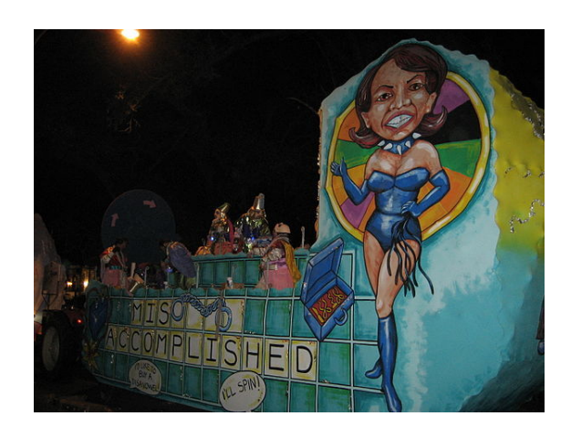
"Wheel of Torture" float, satirizing TV show "Wheel of Fortune" and US government use of torture. New Orleans Mardi Gras, 2007

Carnival celebrations, usually referred to as Mardi Gras