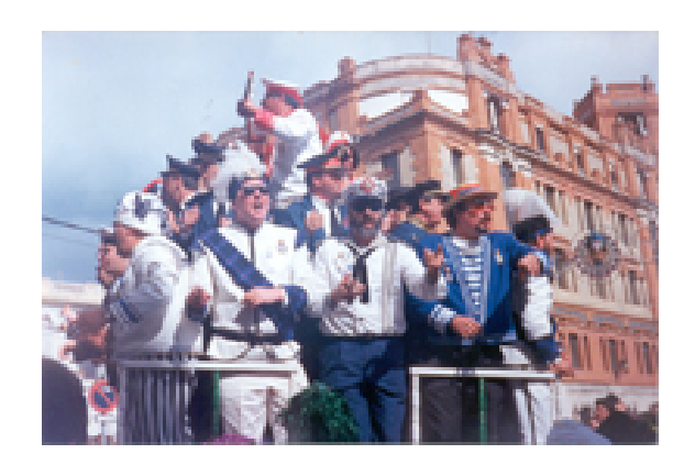
A choir singing in the Carnival of Cádiz

household topics, wearing the same costume, which they prepare for the whole year. The Choirs ( coros ) are wider groups that go on open carts through the streets singing with an orchestra of guitars and lutes. Their signature piece is the "Carnival Tango", alternating comical and serious repertory. The comparsas are the serious counterpart of the chirigota in Cádiz, and the poetic lyrics and the criticism are their main ingredients. They have a more elaborated polyphony that is easily recognizable by the typical countertenor voice.