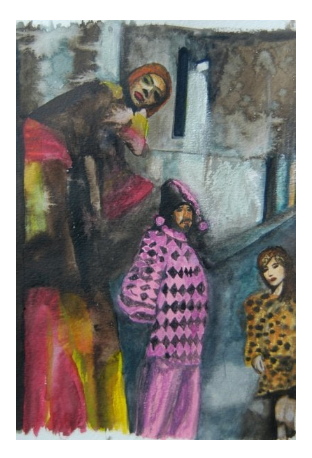
Vidalot is the last night of revelry before Ash Wednesday in Vilanova. Water color painting by Brad Erickson.

Ash Wednesday with elaborate funeral rituals marking the death of King Carnival, who is typically burned on a pyre in what is called the burial of the sardine ( enterrament de la sardina ), or, in Vilanova, as l'enterro .<sup>[64]</sup>