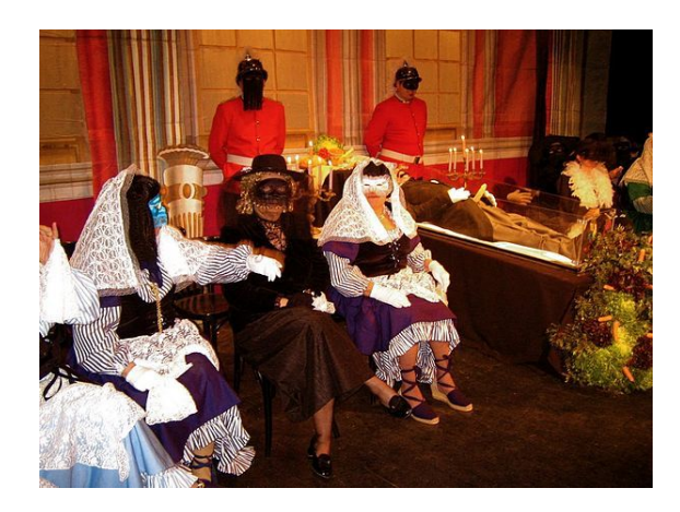
"Ploranyeres" weep for the death of His Majesty and the loss of pleasure.