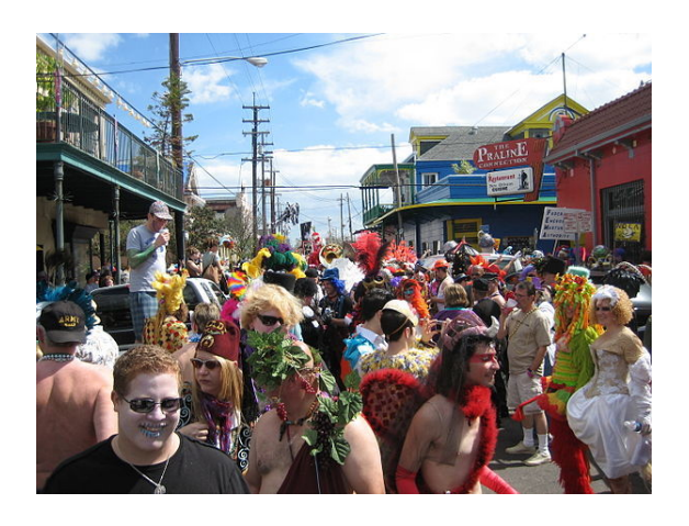
Revelers on Frenchmen Street, 2006

Mardi Gras celebrations are spreading to other regions, such as the Mississippi Valley region of St. Louis, Missouri; Orlando, Florida in Universal Studios and in the Gaslamp Quarter of San Diego.