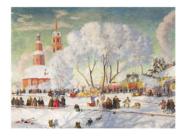
Boris Kustodiev's painting of Maslenitsa

Maslenitsa (Масленица, also called Pancake Week or