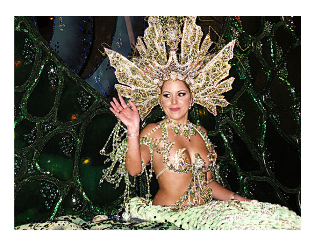
Carnival Queen of Santa Cruz de Tenerife 2009

The Santa Cruz Carnival is, with the Carnival of Cadiz, the most important festival for Spanish tourism and