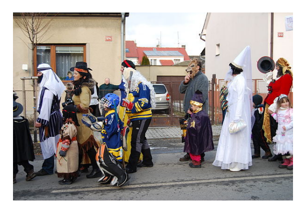
Masopust masks in Czech Republic, 2013