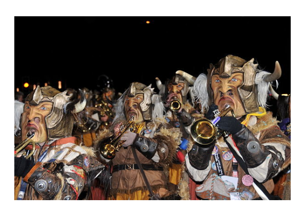
From the Monstercorso on Güdisdienstag's evening in Lucerne (2009)

"Swabian-Alemannic" Carnival (Schwäbische Fastnacht) The "Swabian-Alemannic" Carnival, known as Schwäbische Fastnacht, takes place in Baden and Schwaben (Swabia, Southwestern Germany), the Allgäu, Elsass (i.e. Alsace) and Vorarlberg (Western Austria). During the pagan era it represented the time of year when the reign of the grim winter spirits is over and these spirits are hunted and expelled. It then adapted to Catholicism. The first official record of "Karneval, Fasching or Fastnacht" in Germany dates to 1296.