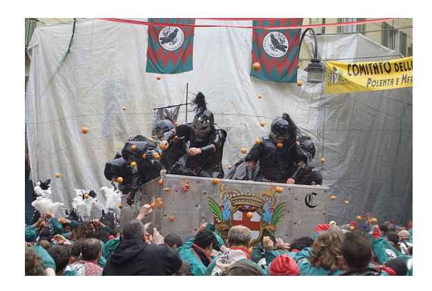
The Battle of the Oranges at carnival of Ivrea