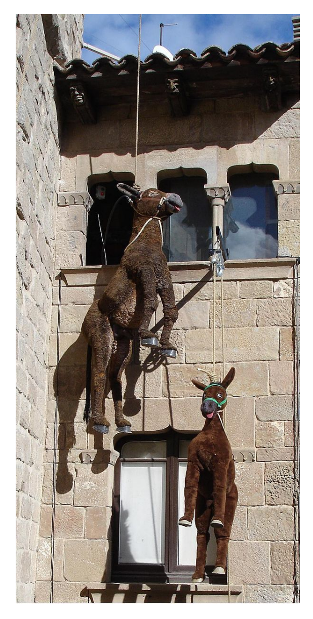
Donkeys of Solsona, hung in the tower bell.

Carnaval de Solsona takes place in Solsona, Lleida. It is one of the longest; free events in the streets, and nightly concerts run for more than a week. The Carnival is known for a legend that explains how a donkey was hung at the tower bell – because the animal wanted to eat grass that grew on the top of the tower. To celebrate this legend, locals hang a stuffed donkey at the tower that "pisses" above the excited crowd using a water pump. This event is the most important and takes place on Saturday night. For this reason, the inhabitants are called "matarrucs" ("donkey killers"). [69]