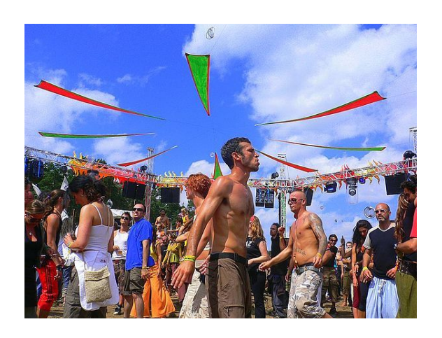
Revellers at the modern Goan Carnival

In India, Carnival is celebrated only in the state of Goa, where it is known as 'Intruz' (from Entrudo, an alternative Portuguese name for Carnival). The largest celebration takes place in the city of Panjim. It was introduced by the Portuguese who ruled Goa for over four centuries. The Carnival is celebrated for three days and nights, when the legendary King Momo takes over the state. All-night parades occur throughout the state with bands, dances and floats and grand balls are held in the evenings. [43]