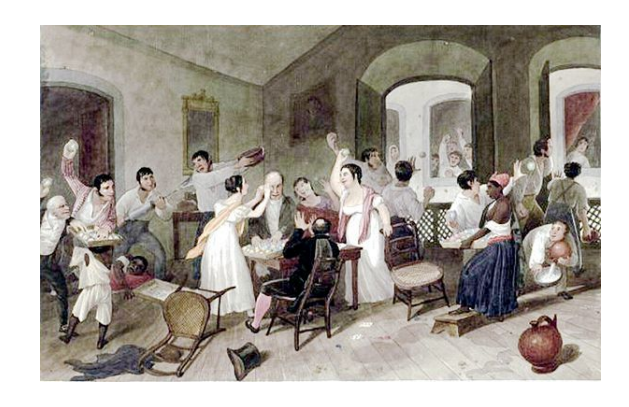
Games during the carnival at Rio de Janeiro, c. 1822