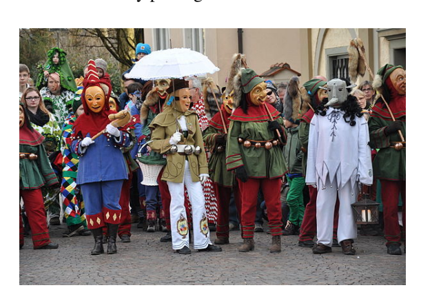
Reitenderle, der Grundholde, Hudelmale, Schnarragagges; popular Fasnet characters from Kisslegg im Allgäu, Swabia.

"Rheinische" Carnival (Fasching) The "Rheinische" Carnival is held in the west of Germany, mainly in the states of North Rhine-Westphalia or Nordrhein-Westfalen, Rhineland Palatinate or Rheinland-Pfalz, but also in Hessen [including Oberhessen], Bavaria and other states. Some cities are more famous for celebrations such as parades and costume balls. Köln or Cologne Carnival, as well as Mainz and Düsseldorf are the largest and most famous. Other cities have their own, often less well-known celebrations, parades and parties such as Worms am Rhein, Speyer, Kaiserslautern, Frankfurt, Darmstadt, Mannheim, Ludwigshafen, Stuttgart, Augsburg and München [Munich] Nürnberg. On Carnival Thursday (called "Old Women Day" or "The Women's Day") in commemoration of an 1824 revolt by washerwomen, women storm city halls, cut men's ties, and are allowed to kiss any passing man.