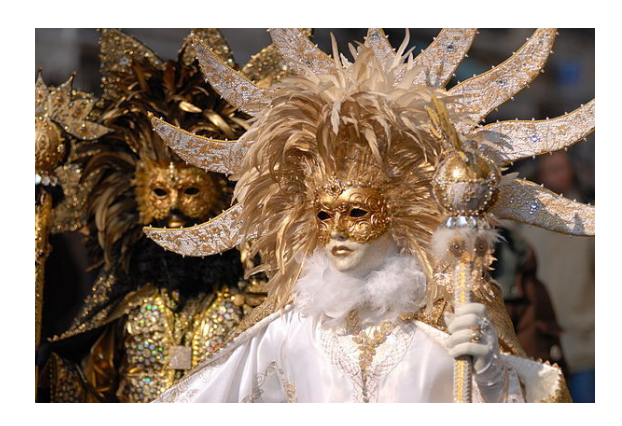
This Venetian tradition is most famous for its distinctive masks

The most famous Carnivals of Italy are held in Venice,