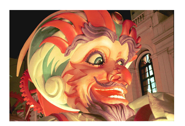
The float of the King Carnival parading in Patras, Greece

In Greece Carnival is also known as the Apokriés (Greek: Aποκριές, "saying goodbye to meat"), or the season of the "Opening of the Triodion", so named after the liturgical book used by the church from then until Holy Week. One of the season's high points is Tsiknopempti, when celebrants enjoy roast beef dinners; the ritual is repeated the following Sunday. The following week, the last before Lent, is called Tyrin\bar{e} (Greek: Tυρινή, "cheese [week]") because meat is forbidden, although dairy products are not. Lent begins on "Clean Monday", the day after "Cheese Sunday". Throughout the Carnival season, people disguise themselves as maskarádes ("masqueraders") and engage in pranks and revelry.