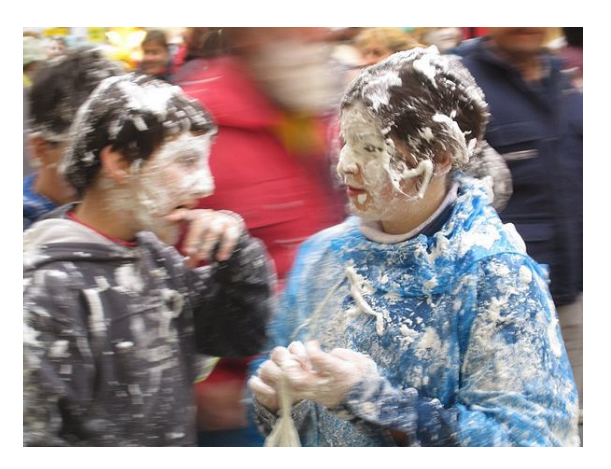
Children become covered in meringue during Dijous Gras.

Adults have a meringue battle at midnight at the historic