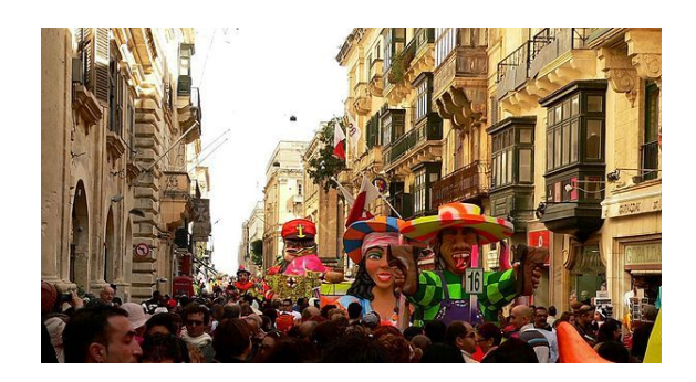
Carnival procession in Valletta on Malta