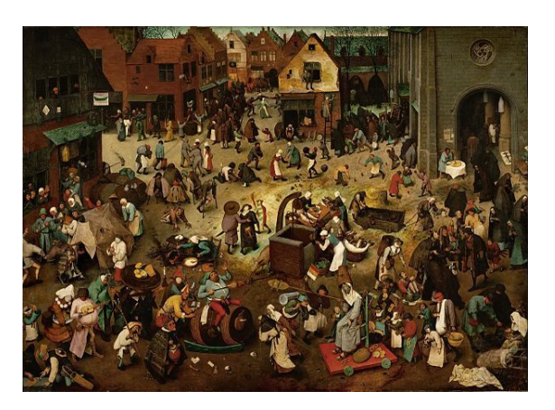
The Fight Between Carnival and Lent, Pieter Bruegel 1559 , Den Bosch

Main article: Carnival in the Netherlands Carnival in the Netherlands is called Carnaval , Vaste -